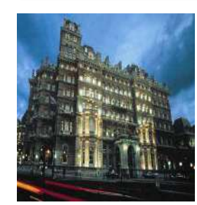
The Langham, London