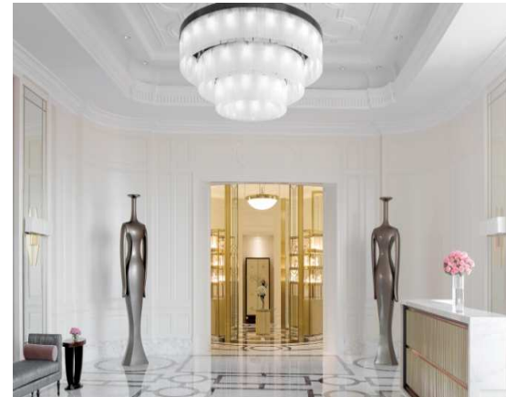
The Langham, Haikou Hainan, China With 249 rooms Opened in June 2016