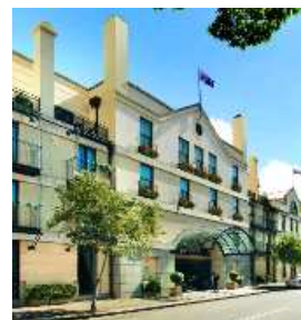
The Langham, Sydney