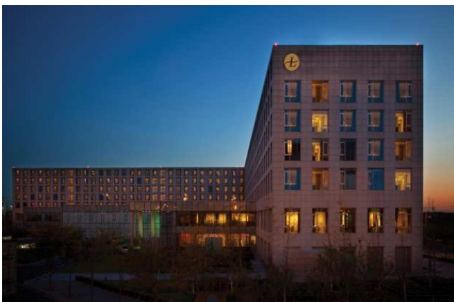
Cordis, Beijing Capital Airport With 372 rooms Opened in August 2010 (rebranded from Langham Place in November 2017)