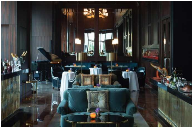
The Langham, Shenzhen Guangzhou, China With 352 rooms Opened in October 2012