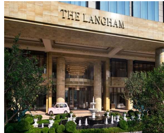
The Langham, Hefei Anhui, China With 339 rooms Opened in October 2018