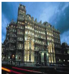
The Langham, London