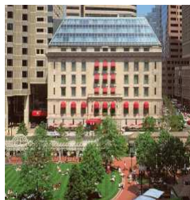
The Langham, Boston