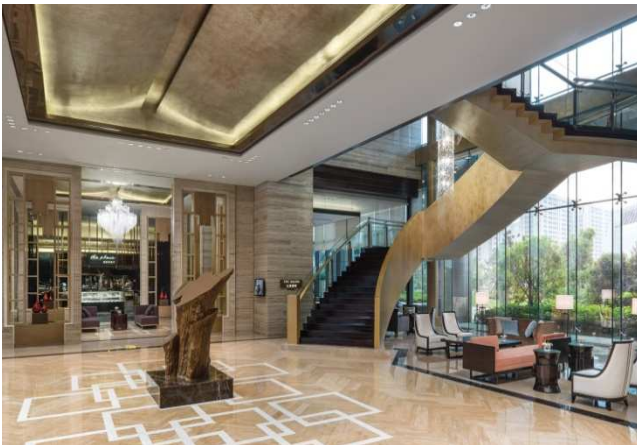
Langham Place, Haining Zhejiang, China With 263 rooms Opened in July 2015