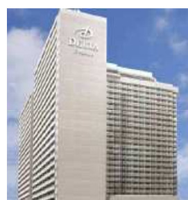
Chelsea Hotel, Toronto