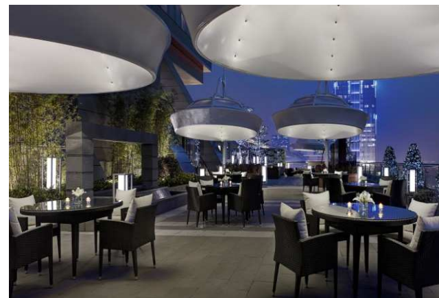
Langham Place, Ningbo Culture Plaza With 143 rooms Opened in 2014