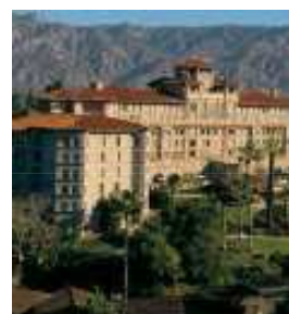
The Langham, Pasadena