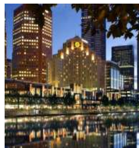
The Langham, Melbourne