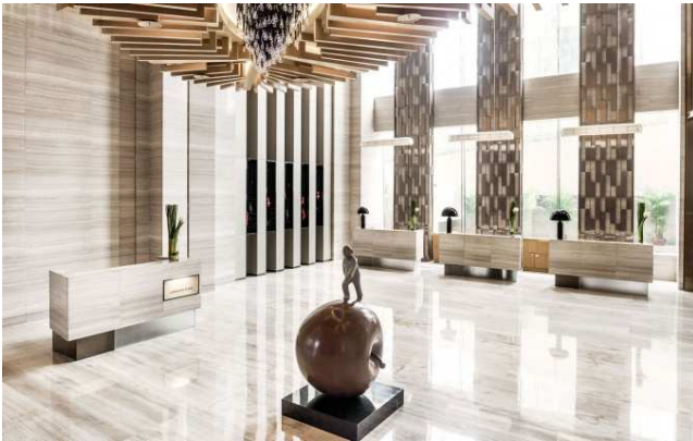
Langham Place, Xiamen Xiamen, China With 327 rooms Opened in 2014