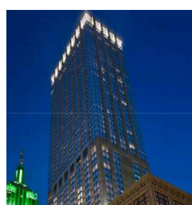
The Langham, New York