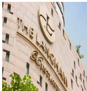
The Langham, Xintiandi