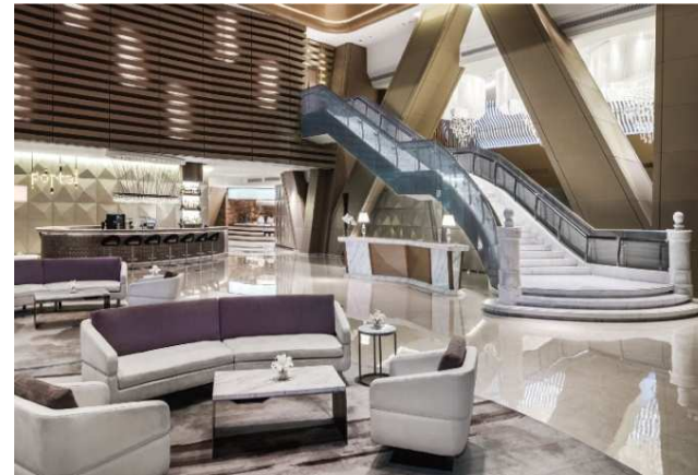
Langham Place, Guangzhou Guangzhou, China With 500 rooms Opened in 2013