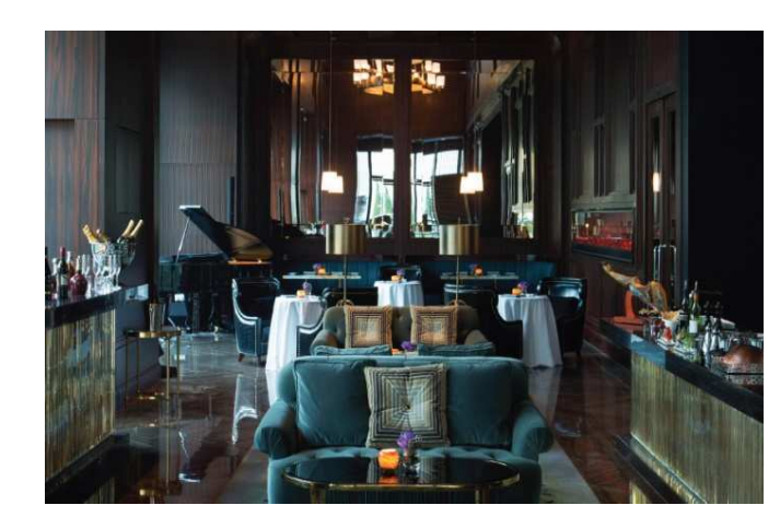
The Langham, Shenzhen Guangzhou, China With 352 rooms Opened in October 2012