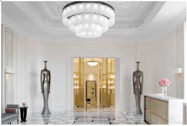
The Langham, Haikou Hainan, China With 249 rooms Opened in June 2016

Langham Place, Haining Zhejiang, China With 263 rooms Opened in July 2015