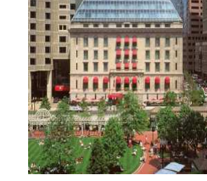
The Langham, Boston